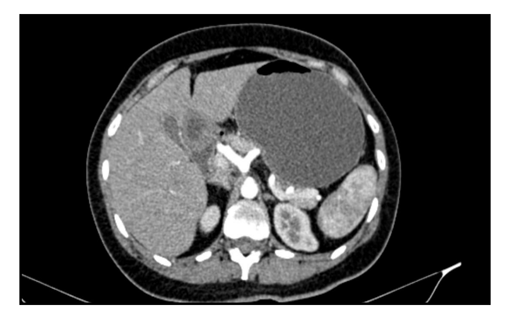
Figure 1: Axial CT abdomen with IV contrast showing the hooking appearance.

Diagnosis of median arcuate ligament syndrome was made at this time as shown in Figure1 and 2 .