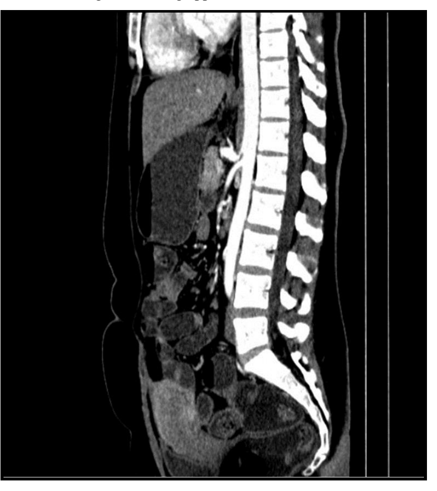
Figure 2: Sagittal (lateral) view of CT abdomen showing acute narrow angle of the celiac trunk.